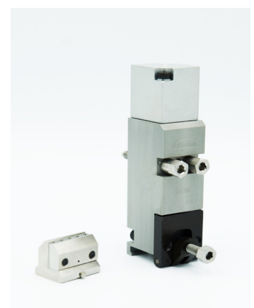
Rhythm Construction nozzle (left) and Universal module with universal clamping feature (right)

For more on, h your tative t your regional