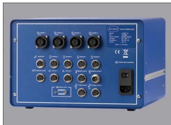
Quick connect cable connections permit easy installation.