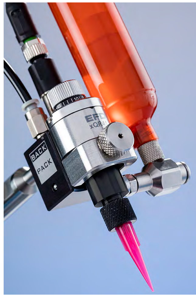
The xQR41V can be used with any Nordson EFD dispense tips to apply a wide range of fluids.

Needle valve system for precise, consistent fluid control