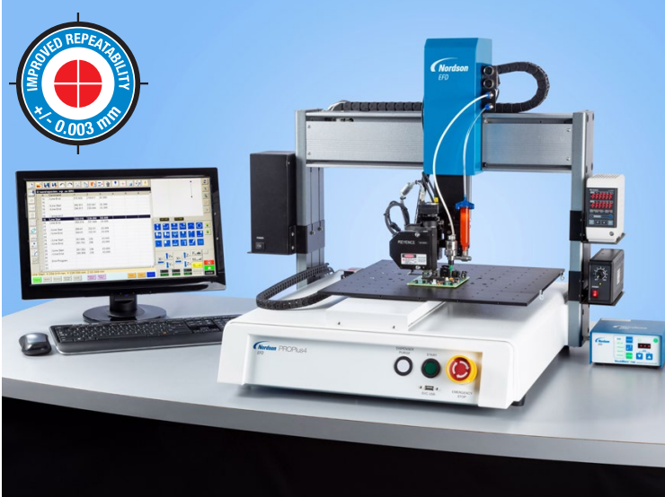
Integrated vision and laser make the PROPlus / PRO Series a complete automated solution.

A complete, vision-guided automation solution