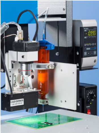
Smart vision CCD camera verifies product presence and orientation.