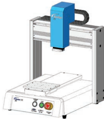
E3 (300 x 300 x 100 mm)