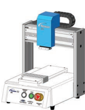
E2 (200 x 200 x 50 mm)

E Series makes automation easy and is available in five sizes for a wide range of working envelopes.