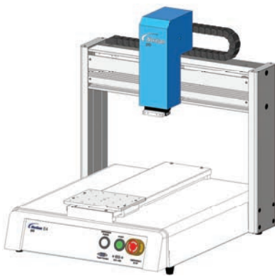
E4 (400 x 400 x 100 mm)